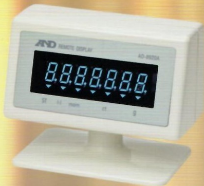
Remote Display (optional)

Finally, a balance worth its weight in gold